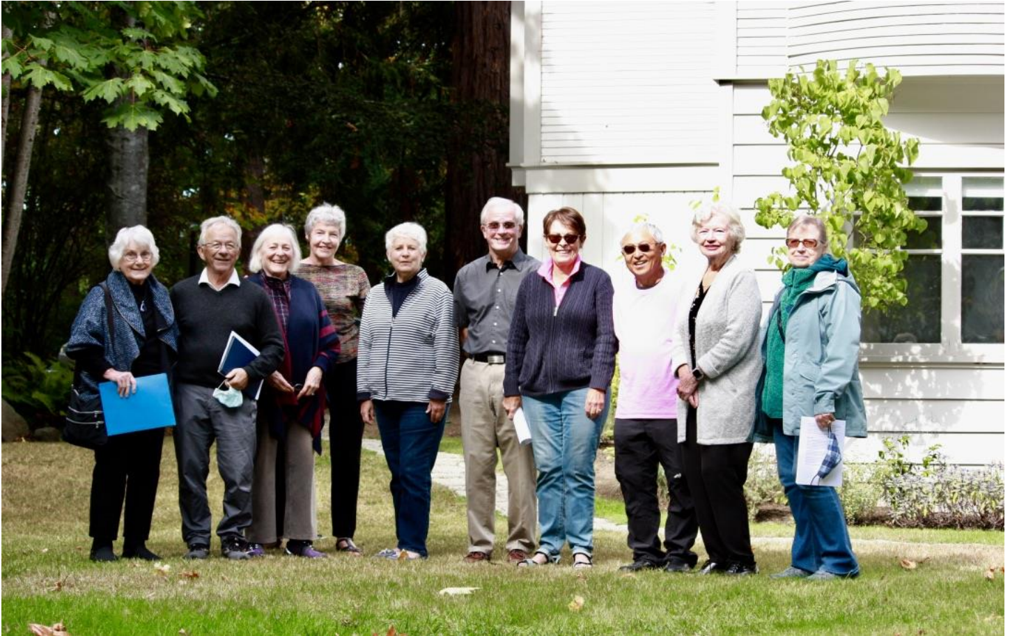
Goward House Board of Directors (left to right)