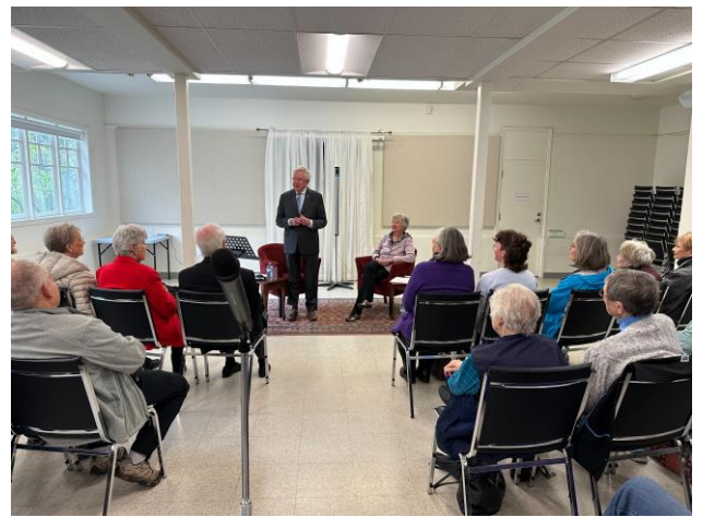
An impressive turn out for Rt. Honourable Joe Clark's presentation April 20 th .