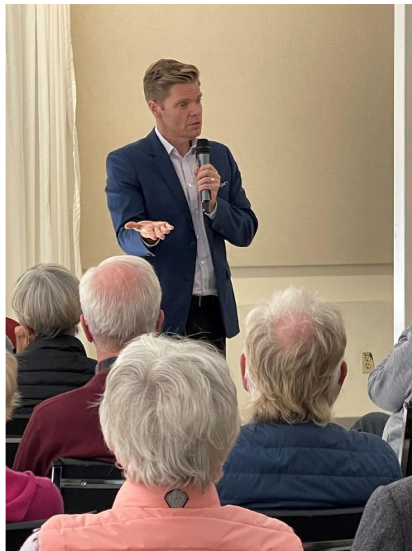
Saanich Mayor Dean Murdock