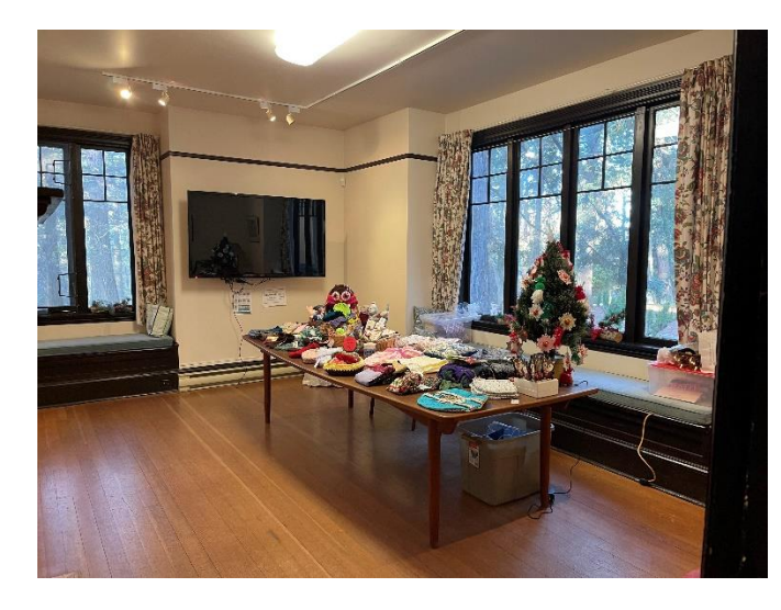
Goward House Crafters table – almost a sell out!