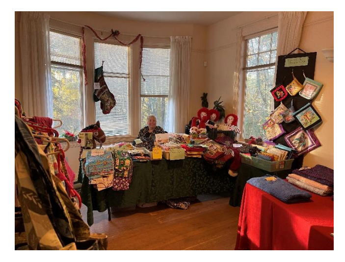
Elaine Leonard is ready for the Craft Fair!