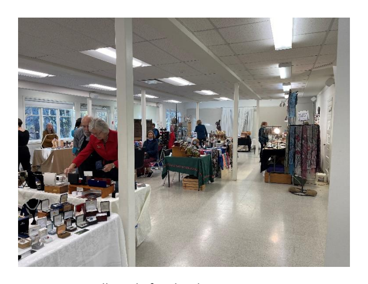
Lower Hall ready for the doors to open.