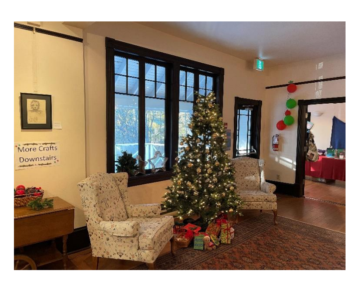
Cozy set-up for the Craft Fair.