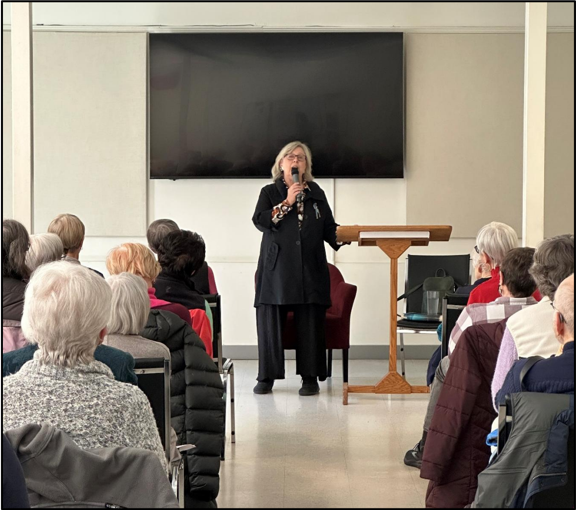
Elizabeth May - MP Saanich-Gulf Islands and leader of the Green Party at our very well attended presentation Thursday March 6 th , 2025.